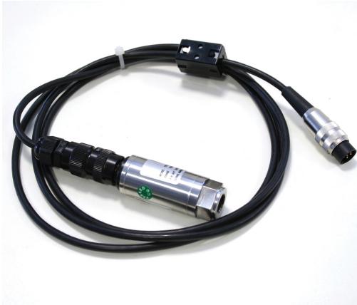
82-P0700 700bar pressure transducer with 82-P0349/ELT connection cable